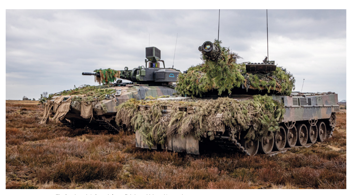
The Bundeswehr's Puma infantry fighting vehicle and Leopard

The paramount task of German security policy is to ensure that we can continue to live in our country at the heart of Europe in peace, freedom and security. Germany's security is indivisible from that of its allies and European partners. Collective and national defence are one and the same. The Federal Government will resolutely resist any military aggression or attempts at intimidation aimed at us or our allies. The Bundeswehr remains the guarantor of Germany's deterrence and defence capability. The Bundeswehr is a parliamentary army.