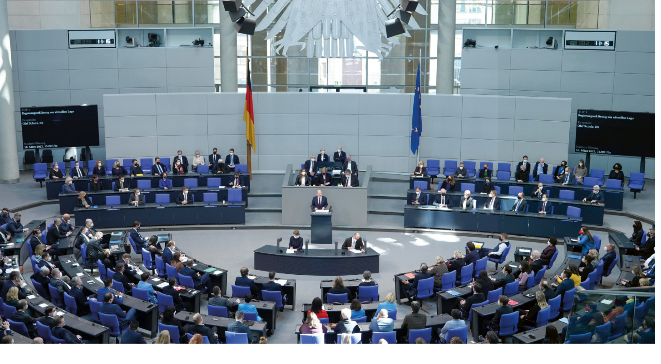
Plenary debate on the Zeitenwende in the German Bundestag on 27 February 2022

rising sea levels, altered precipitation patterns, the loss of biodiversity and the depletion of natural resources all threaten people's livelihoods and the very foundations of our economies. Climate-induced extreme weather events with devastating consequences are happening with greater frequency and intensity, also in Germany. This places critical infrastructure under additional pressure. In many regions of the world, the climate crisis is fuelling conflict, contributing to hunger and other humanitarian emergencies. The climate crisis also exacerbates existing inequalities. It already has security ramifications today. Human security also depends on how we deal with this existential threat to vital resources. We cannot, however, completely eliminate these impacts; the best we can do is limit them. At the