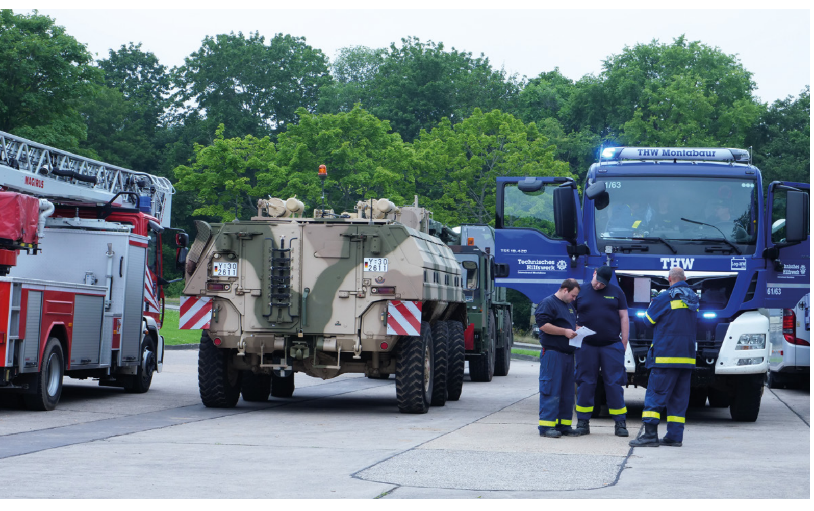
Crises and disasters are successfully tackled through the cooperative efforts of various authorities and institutions.

expand its space capabilities and work to further develop the international order in space.