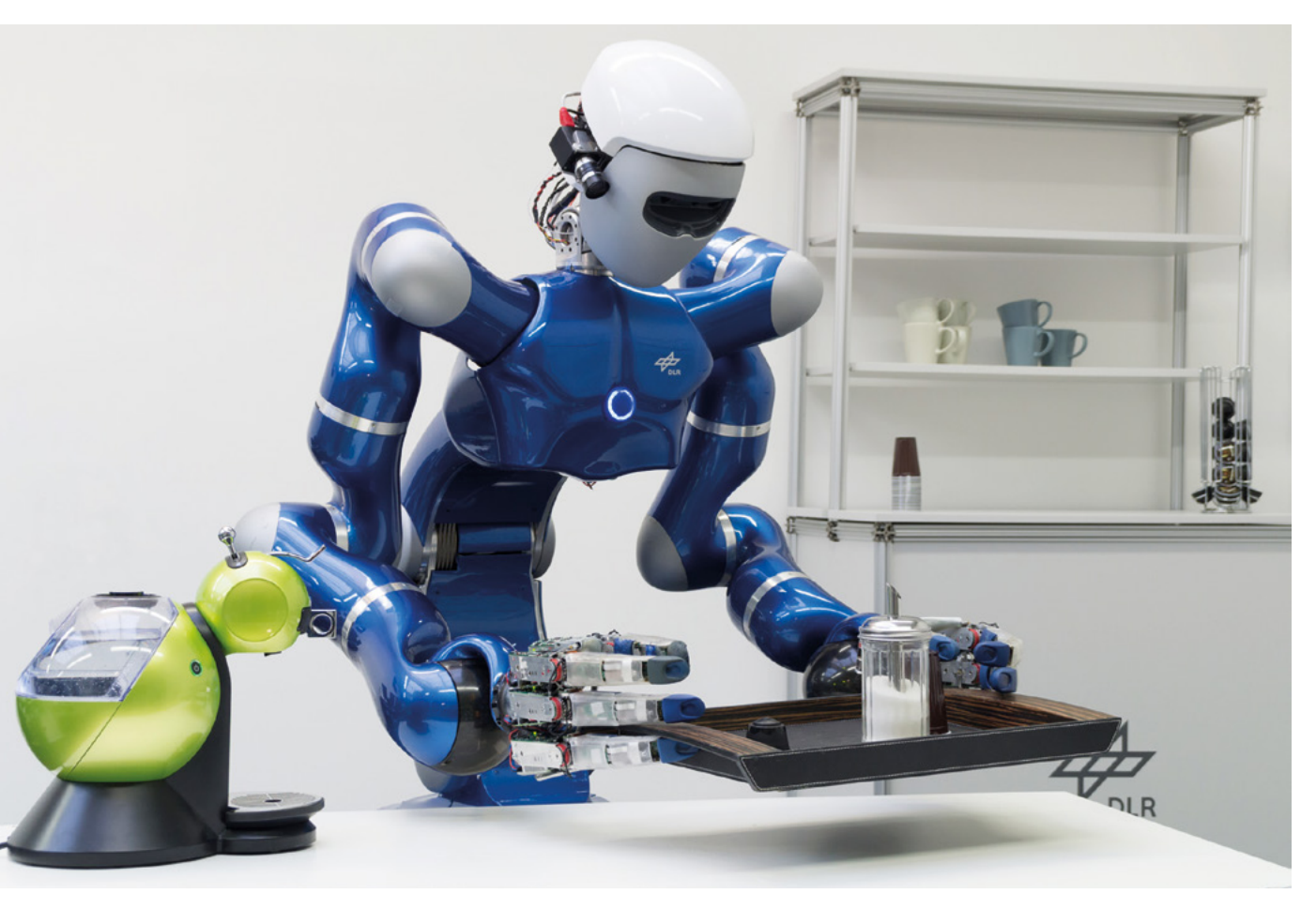
The Federal Government specifically promotes research into, and the introduction of, new technologies.

technology, for example through state anchor contracts, in order to maintain and build on its own research and development capabilities in critical technologies.