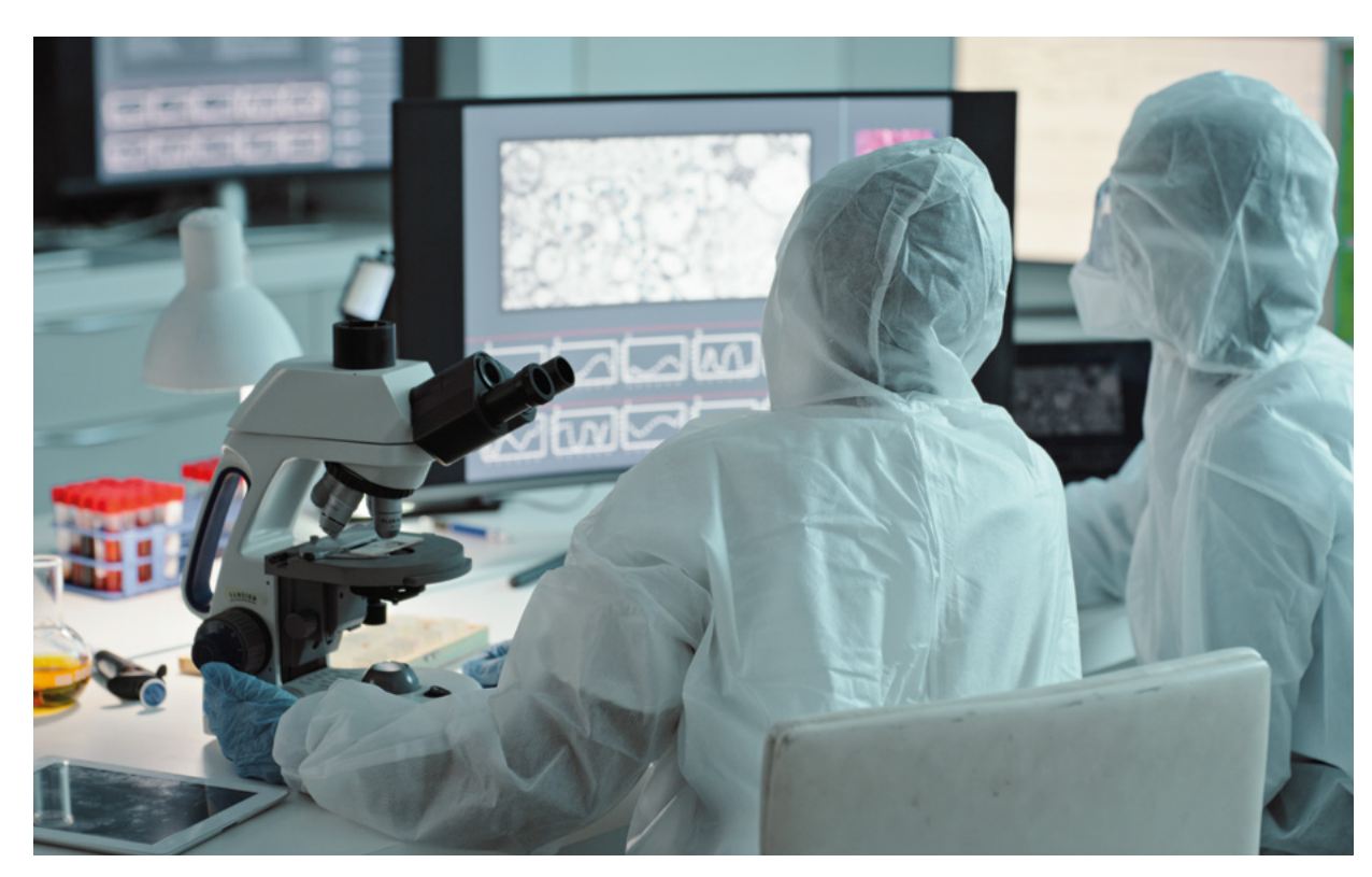
The global prevention of, and swift reaction to, pandemics is also key to guaranteeing human security.