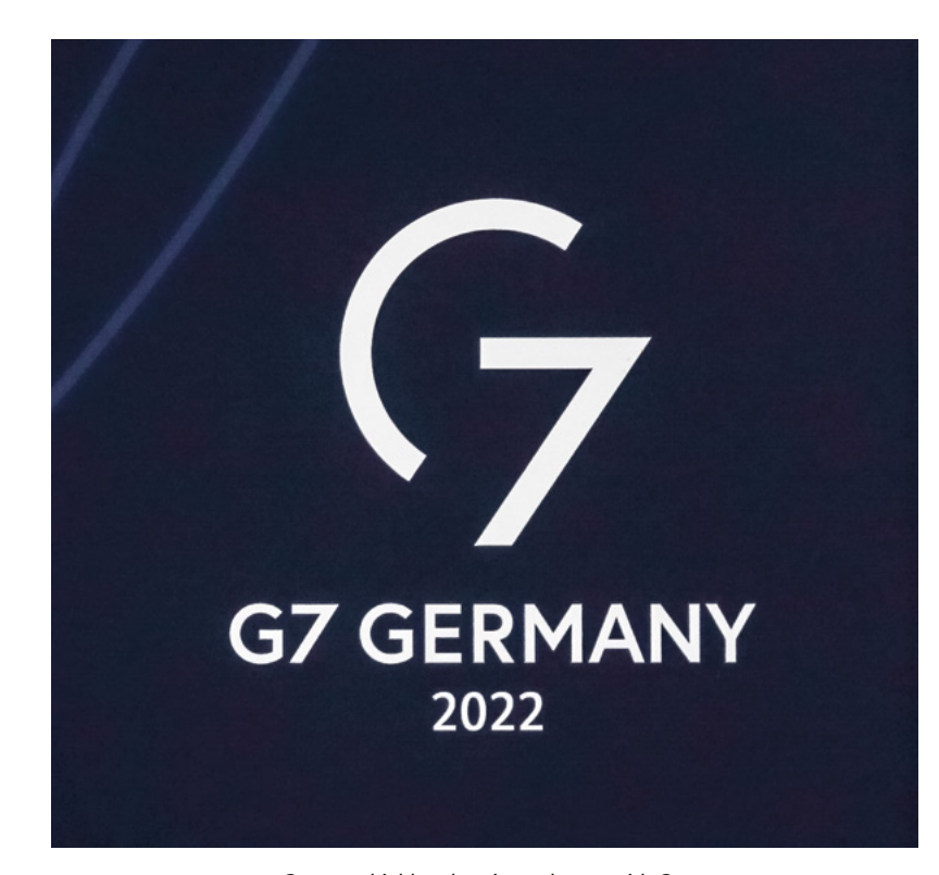
Germany highly values its exchange with G7 partners on current global challenges.

The intensified international competition with regard to technology can give rise to security risks if the free access to certain technologies is no longer guaranteed and one-sided dependencies arise.