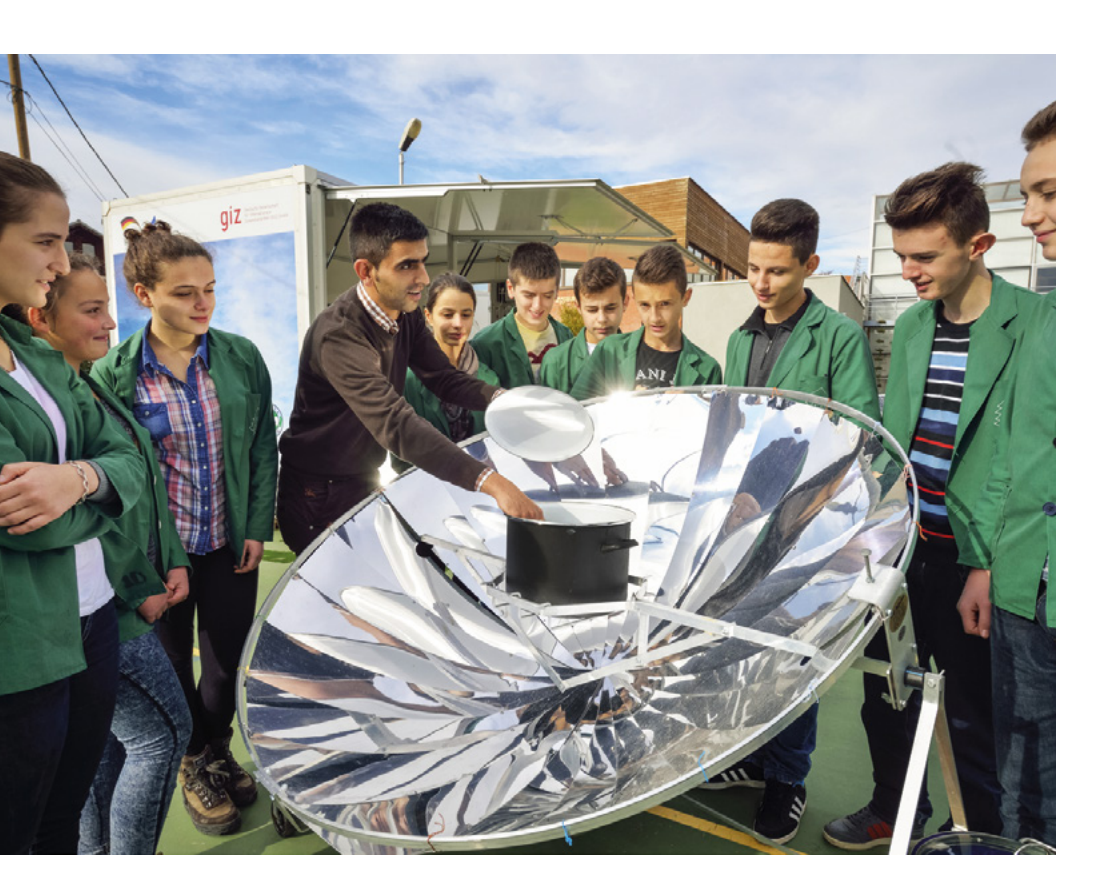
Pupils in Pristina learn how solar technology can be used to address the climate crisis.

Our global resources crisis requires a response on the part of all countries. The Federal Government therefore aims to find global and ambitious solutions. This includes a dialogue with all relevant actors. An openness to all technological possibilities makes it possible to ensure freedom of action, for us and for coming generations.