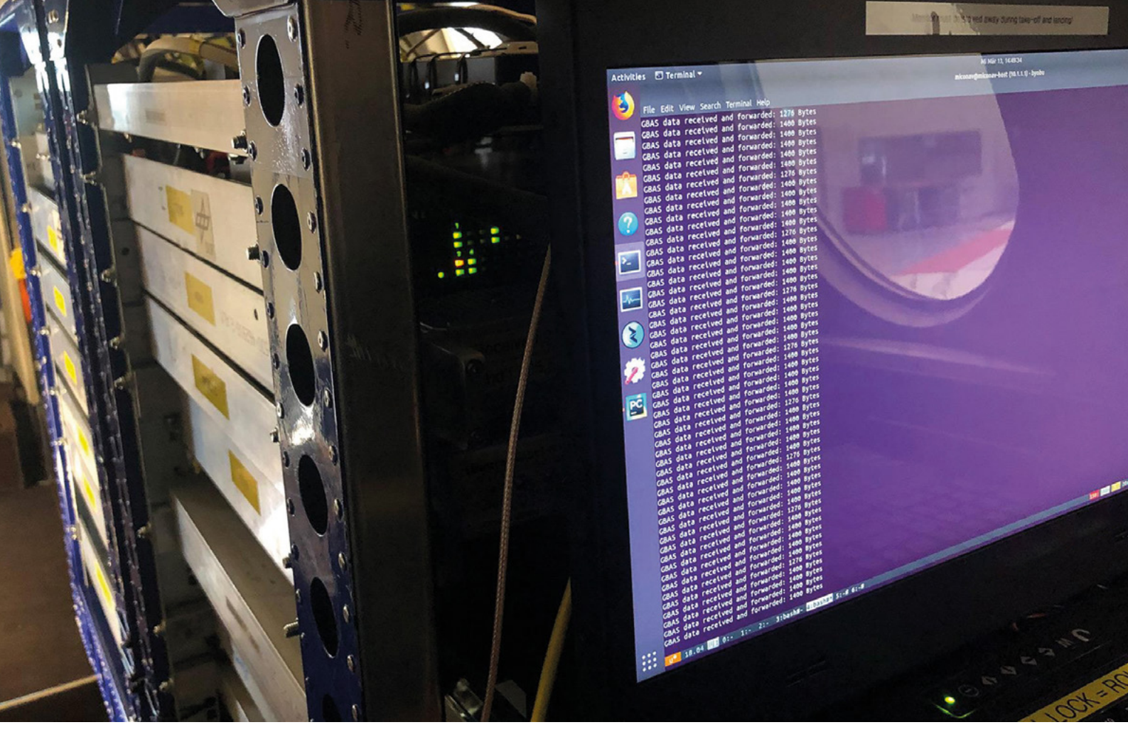
In our increasingly digitally connected society, the security of our IT systems is becoming ever more important.

other affected countries – and then take specific action against them in the form of sanctions.