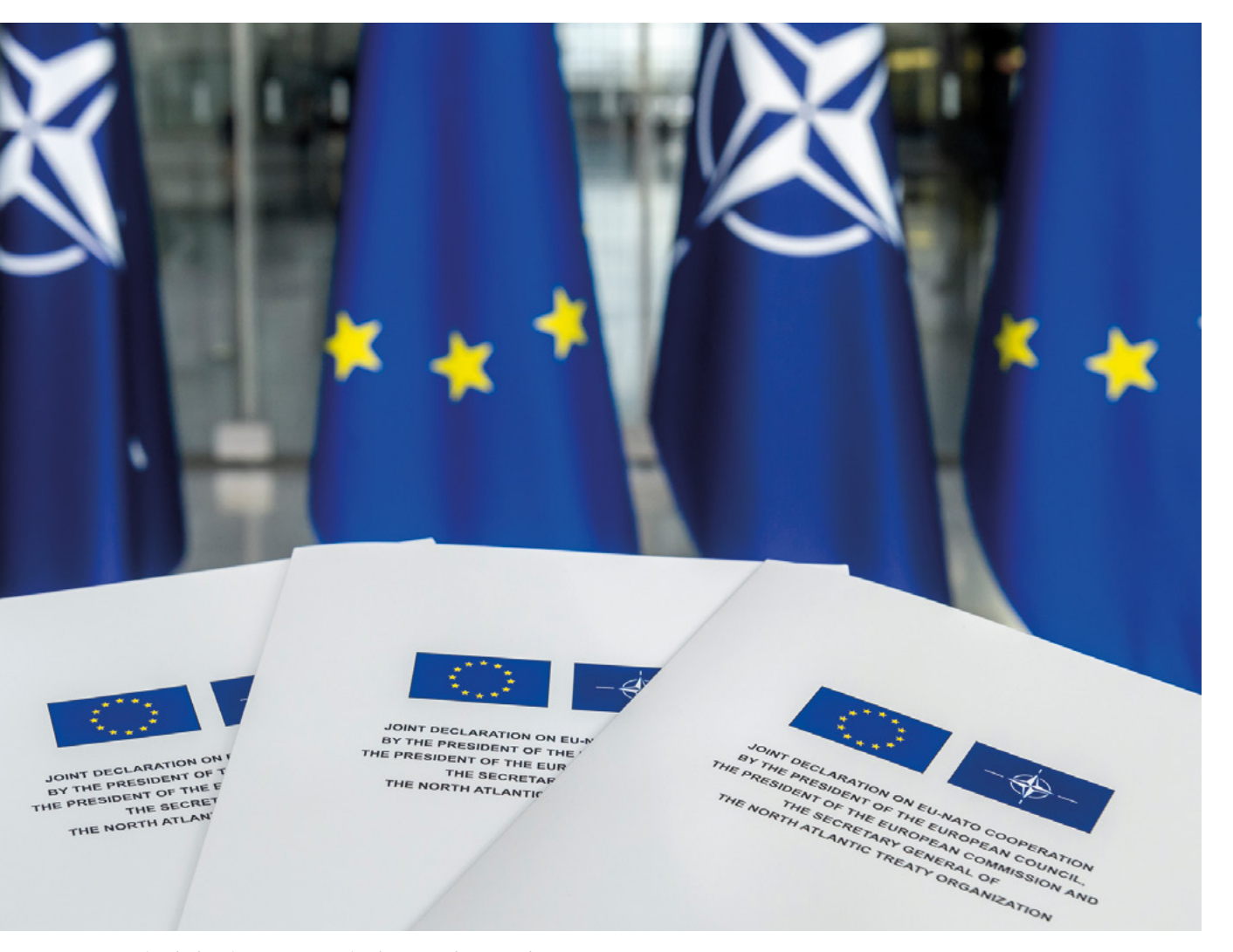
Joint declaration on cooperation between the EU and NATO