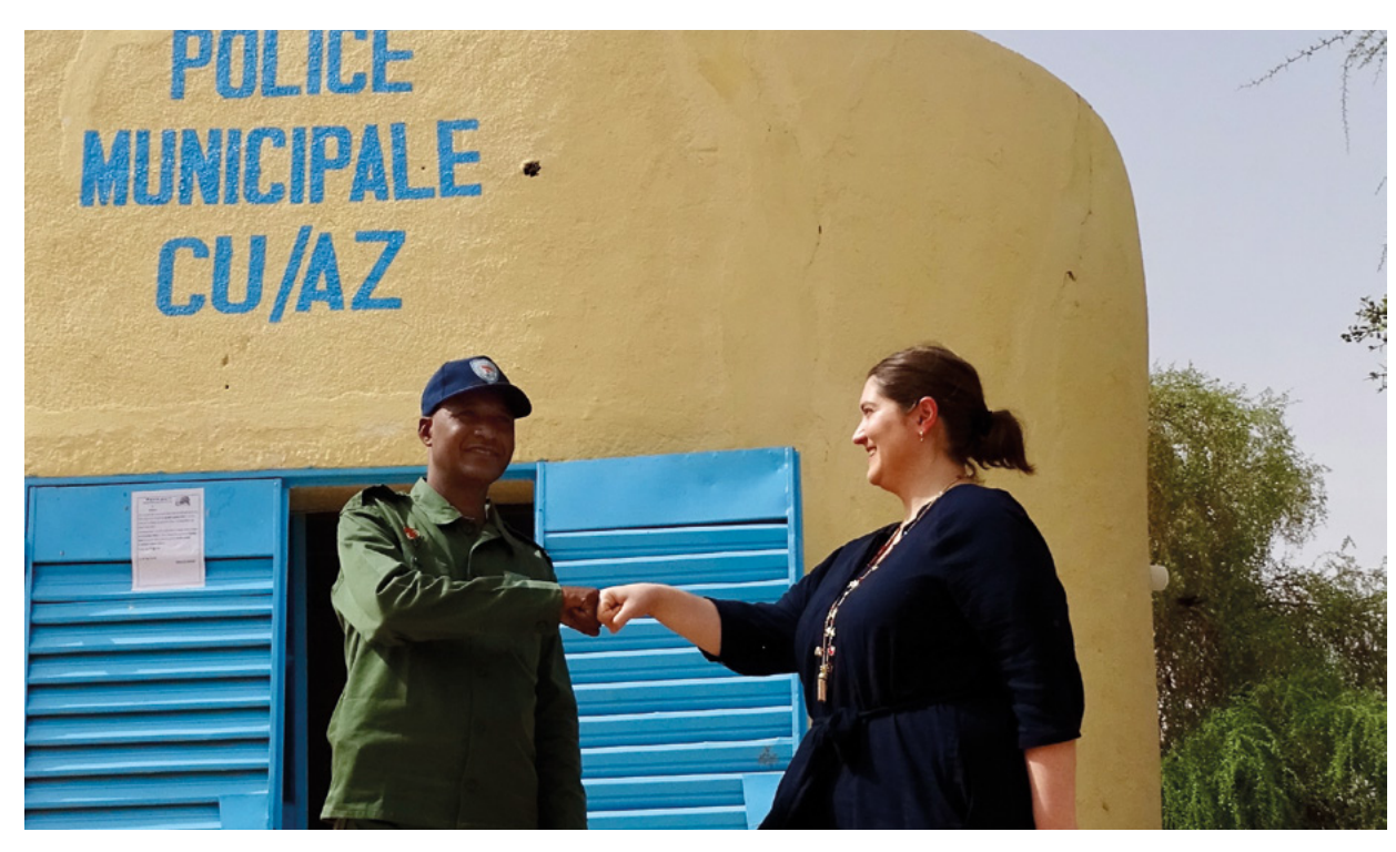
German civilian personnel and police staff are deployed as part of the EUCAP Sahel Niger mission in support of the Niger's security forces that are engaged in the fight against drug, weapon and human trafficking.

The Federal Government is committed to the primacy of preventing crises. We will increasingly pursue our crisis engagement via civilian and military missions and operations under the EU Common Security and Defence Policy. Our instruments for crisis prevention, conflict management and peacebuilding will serve coherent and realistic objectives. They combine civilian, police and military capabilities, with the Bundeswehr continuing to play an important role.