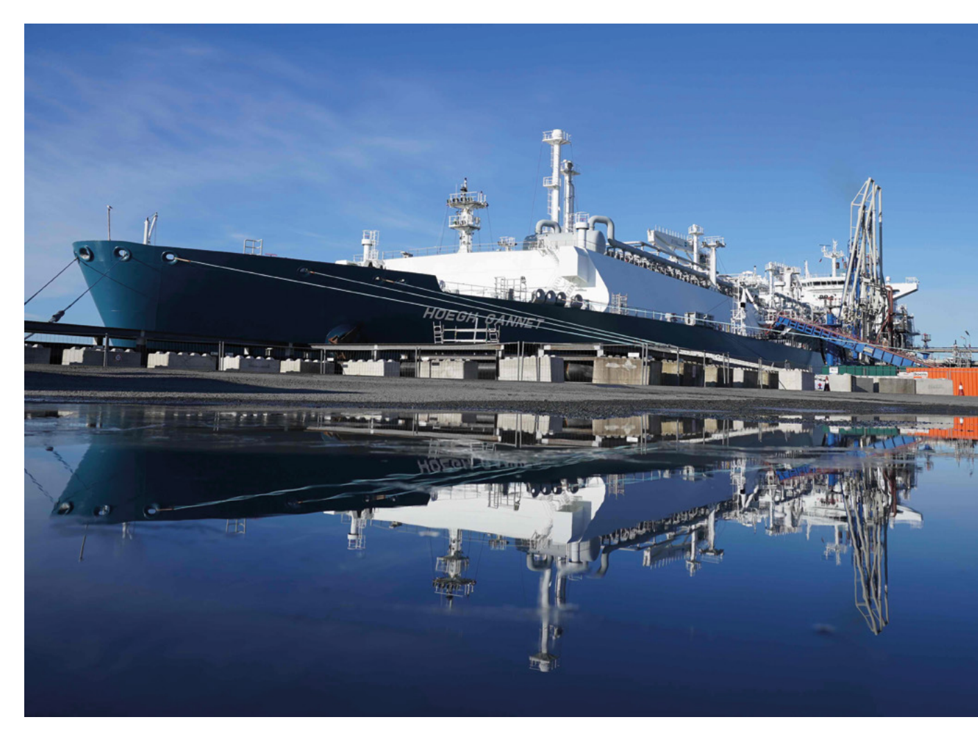
To safeguard its energy security, Germany is also promoting the establishment of LNG terminals off its coast.