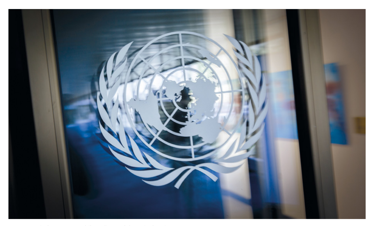
Germany actively supports multilateralism and the United Nations.

The Federal Government advocates the strengthening and further development of a free international order based on international law and the United Nations Charter. Such a rules-based order creates stability and the conditions for peace, security and human development. It also provides our open and interconnected country with protection and scope for development.