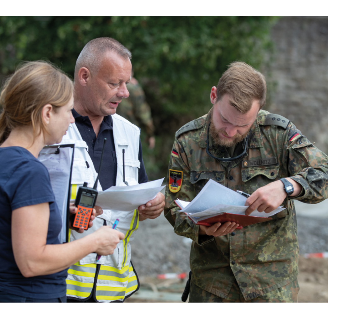
The Bundeswehr supported clean-up efforts after the devastating floods in the Ahr valley.