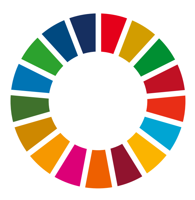
The logo represents the 17 sustainable development goals of the 2030 Agenda for achieving socially, economically and environmentally sustainable development. Implementing them is part of the Federal Government's Integrated Security approach.

Hunger and malnutrition impair people's health, jeopardise the economic foundations of entire societies and lead to setbacks in development work. The Federal Government wants to strengthen global food security via transformation to sustainable agricultural and food systems. In doing so, we will focus in particular on disadvantaged and vulnerable people. In addition, we