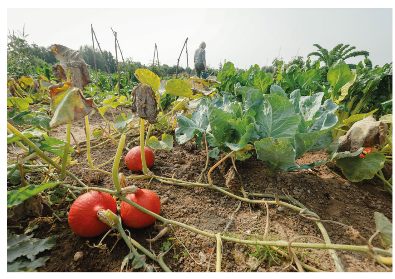
The Federal Government is promoting the transformation to sustainable and resilient agricultural and food systems

The implementation of the human right to adequate food is a guiding principle for the Federal Government's activities. Food insecurity and inadequate nutrition impair people's health. It also adversely affects development policy, inflicts economic damage and destabilises entire societies – with the effects also being felt in Germany.