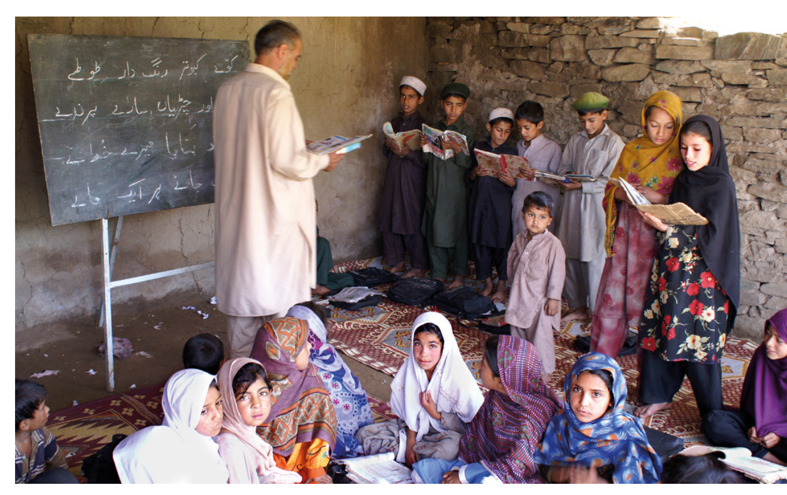
The Federal Government promotes the human right to education all around the world.