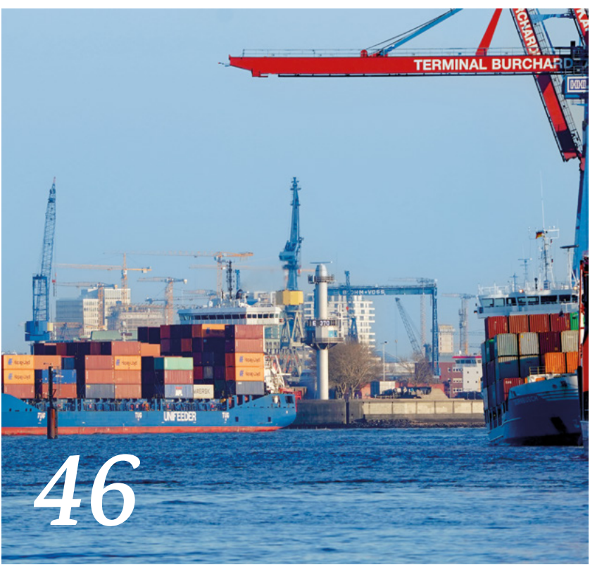
Resilient: Safeguarding our values through inner strength