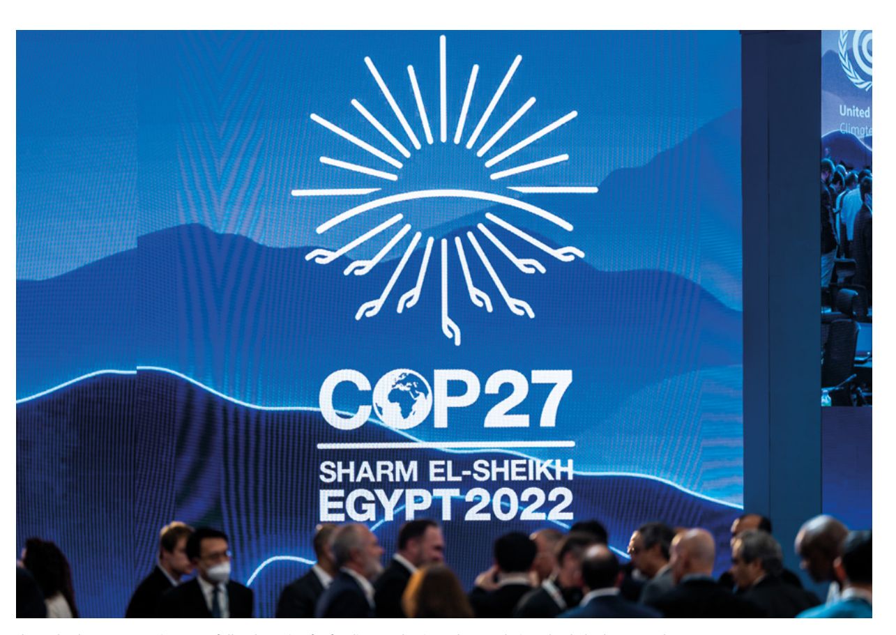
The Federal Government is successfully advocating for funding mechanisms that are designed to help those people who are most severely affected by climate-related damage.

Investment on a massive scale is required globally to fund efforts to accomplish an ecological transformation and to make the necessary adaptations to the climate crisis. International climate funding is therefore essential if this is to succeed. The Federal Government is prepared to keep making substantial contributions in this regard, beyond its current commitments and especially for the period after 2025. At international level, we remain proponents of increased support for the affected countries and continue to press for also raising more private capital for climate finance. When it comes to dealing with loss and damage and to protecting particularly vulnerable developing countries, we are actively striving to rapidly operationalise the respective funding mechanisms. To this end, we are working on ambitious implementation of the Global Shield against Climate Risks, a joint initiative of the G7 and the Vulnerable Twenty (V20) Group.